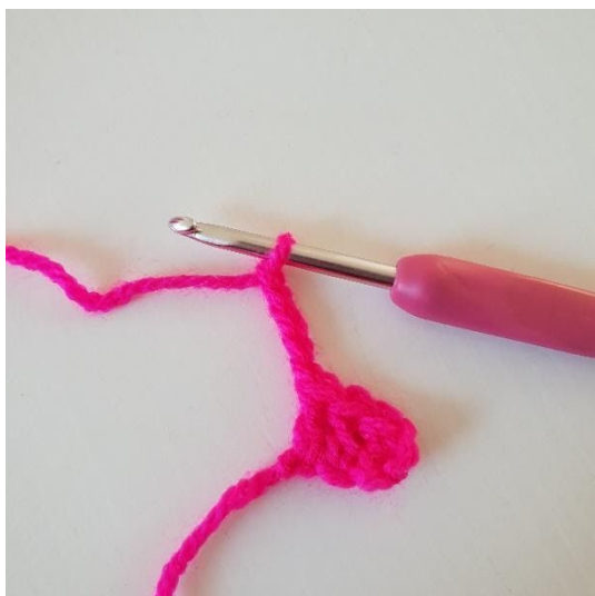
1. Haak 5 lossen.