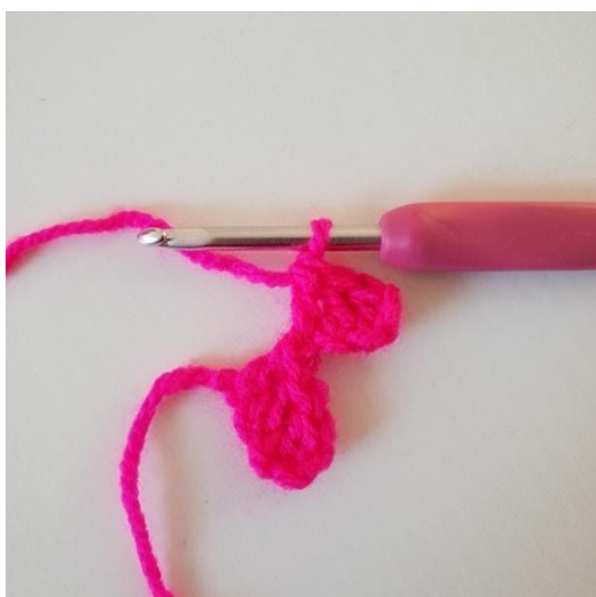
3. Haak Stk in de volgende 2 L. Nu heb je weer een pixel.