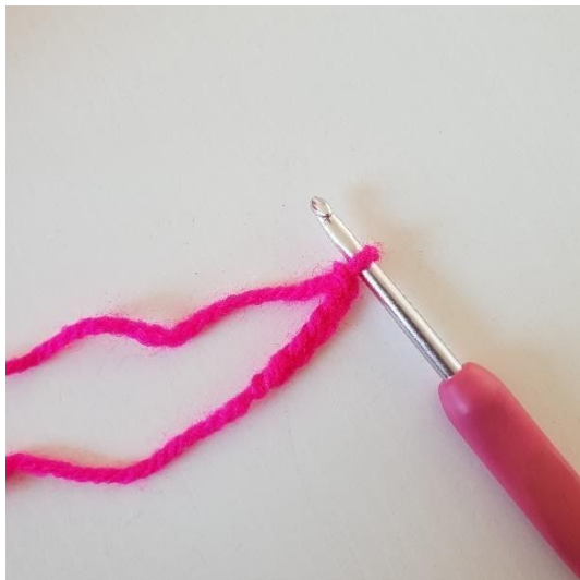
1. Start met 5 lossen.