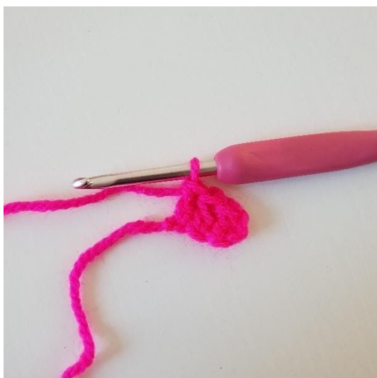
3. Haak Stk in de volgende 2 L. Nu heb je de eerste pixel gehaakt.