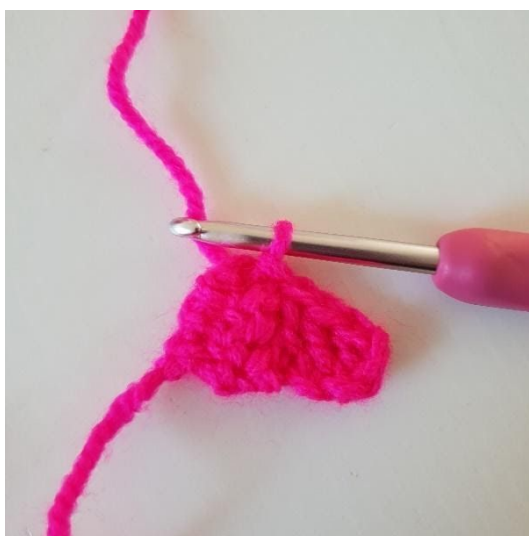
4. Nu moet de pixel worden samen gehaakt met de eerste pixel. Dit doe je door de pixel te keren en haak een Hv in de linkerzijde van de eerste pixel. Zie foto.