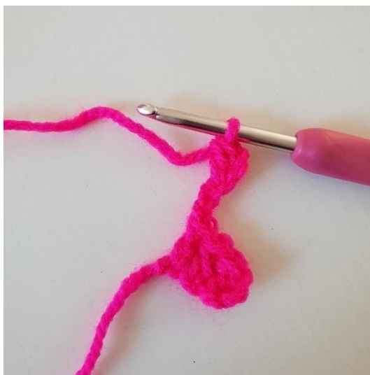
2. Haak 1 Stk in de 3e L vanaf de naald.